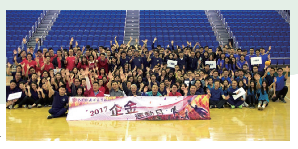
企金團隊運動日 Corporate Banking sports day