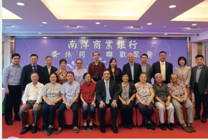
南商榮休同仁聯歡聚餐 A gathering of NCB's retired employees