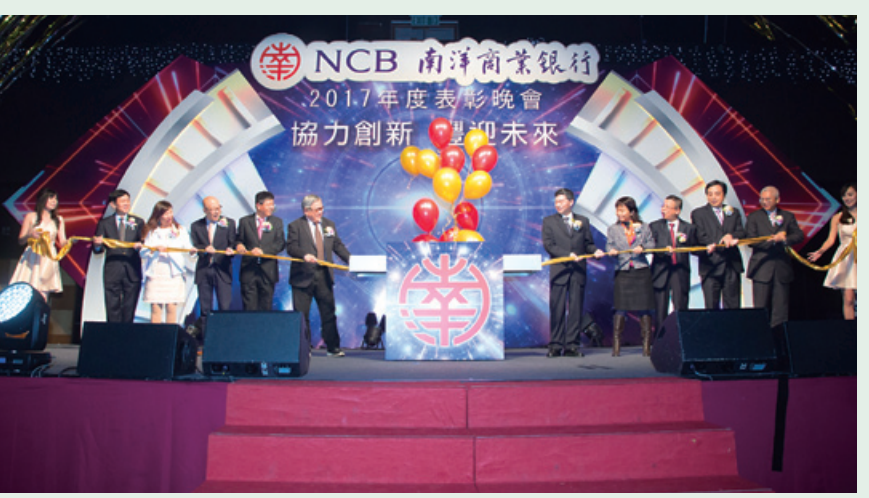
2017年度表彰晚會 2017 Award Presentation Ceremony

The corporate culture of NCB is very popular among employees. During the year, NCB continued to organise travels covering all employees, various team building activities and ball games to enrich the leisure time of its employees.