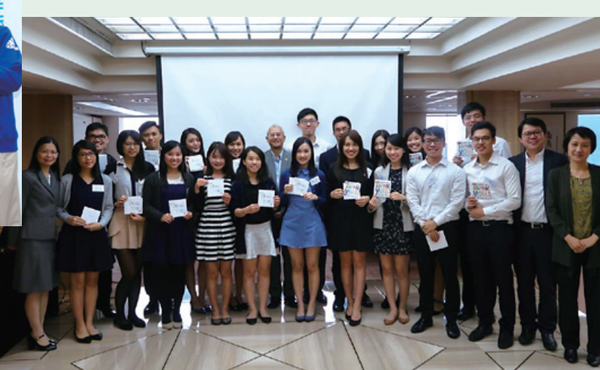
大學畢業生簡報活動 Final presentation of Graduate Trainees

Cinda (HK) and NCB jointly sponsored the "UNICEF Charity Run 2017" and also delegated some colleagues to participate in the Half Marathon Corporate Relay.